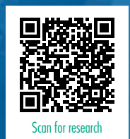
Scan for research

Viricide: Human Influenza Virus (H1N1), Canine Distemper Virus, Avian Influenza Virus (H9N2)